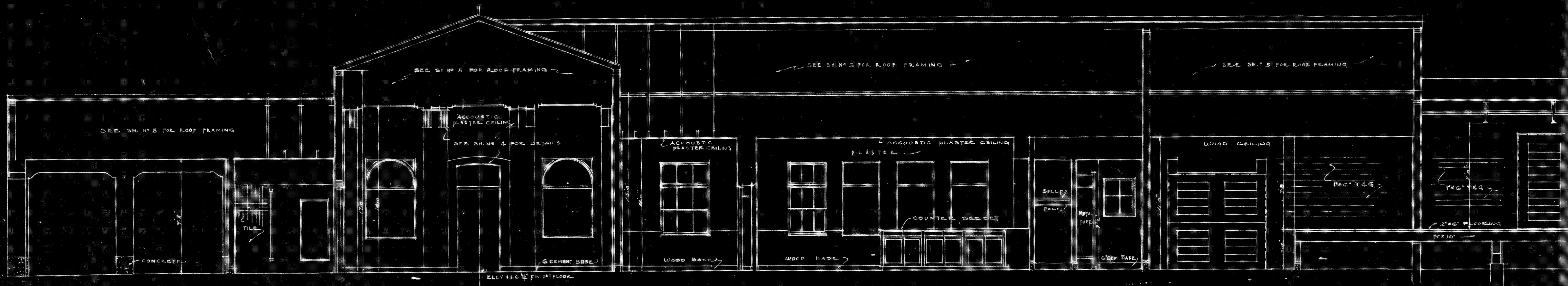
- SECTION "A-A" -