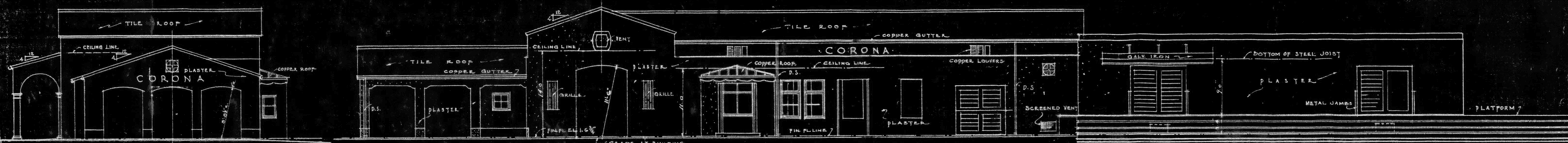
- NORTH ELEVATION -